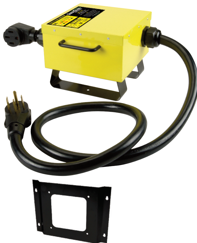
Optional Mounting Bracket