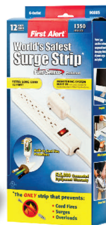
90885 - 12 ft.